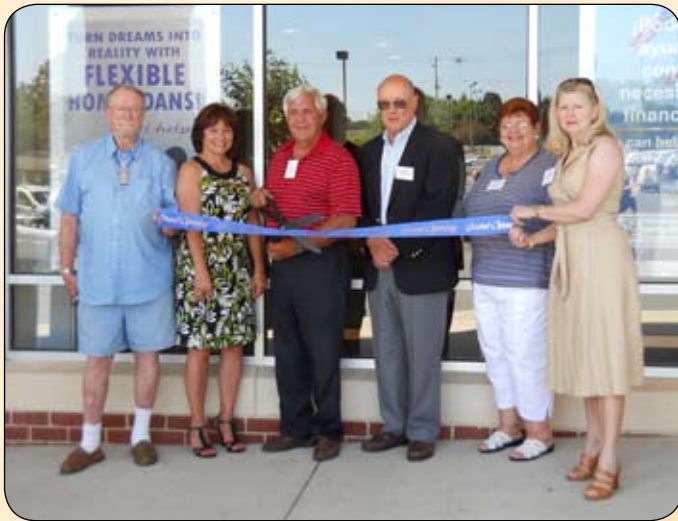
Keystone FCU Ribbon Cutting Ceremony

The credit unions held a shared Grand Opening celebration on July 16, which featured a boardwalk theme where credit union members enjoyed boardwalk games, face painting, food, prizes, and much more.